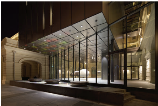
NEW WINGS AT ASIAN CIVILIZATIONS MUSEUM SINGAPORE