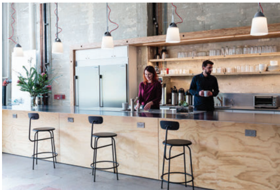
ADAPTIVE REUSE – LANDSCAPE ARCHITECTS OFFICE SAN FRANCISCO, CALIFORNIA