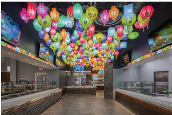
LUCKY DRAGON HOTEL AND CASINO LAS VEGAS, NEVADA