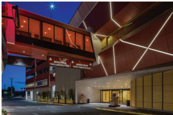
LUCKY DRAGON HOTEL AND CASINO LAS VEGAS, NEVADA