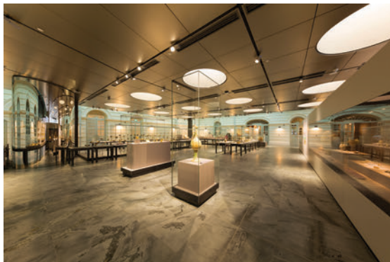
NEW WINGS AT ASIAN CIVILIZATIONS MUSEUM SINGAPORE