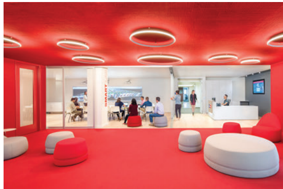
SUFFOLK SAN FRANCISCO HEADQUARTERS SAN FRANCISCO, CALIFORNIA